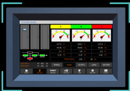
System main data screen.

Windows; Linux; Novell Netware; Mac OS; IBM OS/2; HP OPEN VMs; Most commonly used UNIX operating systems such as: IBM AIX, HP UNIX, SUN Solaris INTEL and SPARC, SCO UNIX and UnixWare, Silicon Graphic IRIX, Compaq Tru64 UNIX and DEC UNIX, BSD UNIX and FreeBSD UNIX, NCR UNIX.