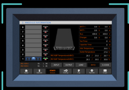
Information screen on the status of the power modules.