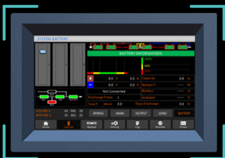
Battery status information screen.